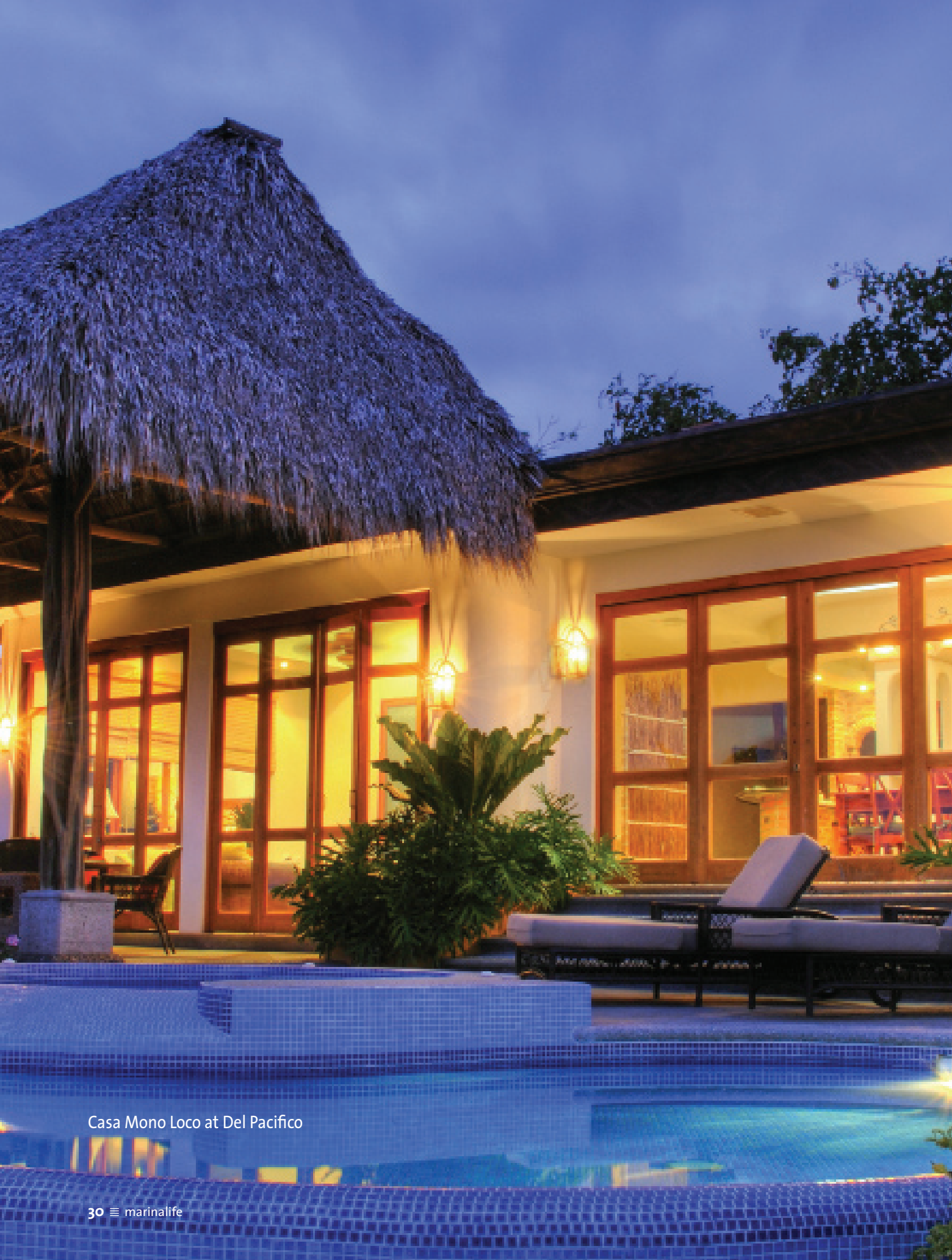
Casa Mono Loco at Del Pacifico