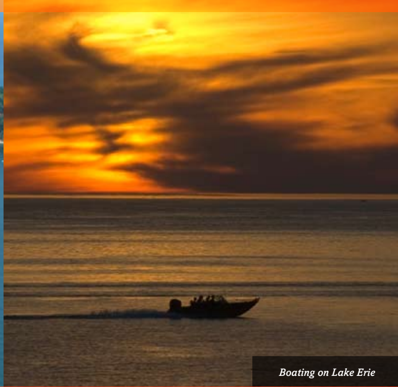
Boating on Lake Erie

guest docks). (1 Cedar Point Road, tel: 419.627.2334)