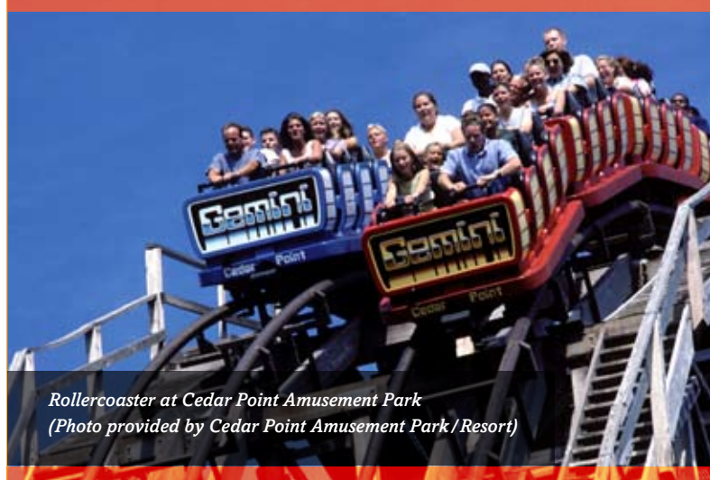
Rollercoaster at Cedar Point Amusement Park

Cedar Point Marina is paradise for boaters who long for first-class amenities and the convenience of being within walking distance of the sights and sounds of the Cedar Point Amusement Park. The Cedar Point Marina accommodates boats up to 125 feet in length in 742 slips (642 permanent and 100