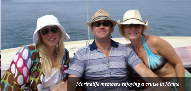
Marinalife members enjoying a cruise in Maine

views of Camden Harbor, the village, and Camden Hills above, and provides easy access to this picturesque town's extensive services and amenities. (tel: 207.236.4378)