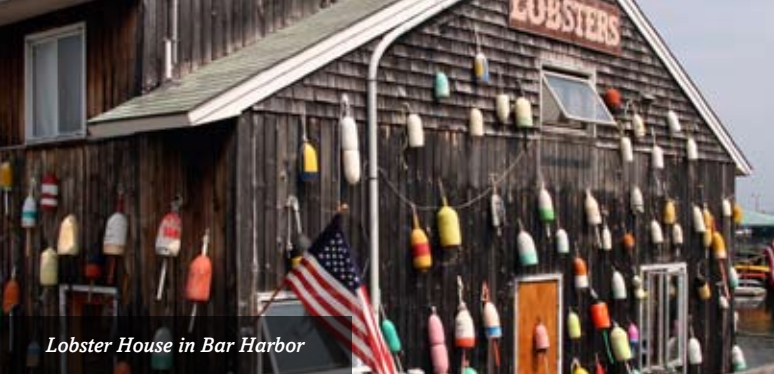
Lobster House in Bar Harbor