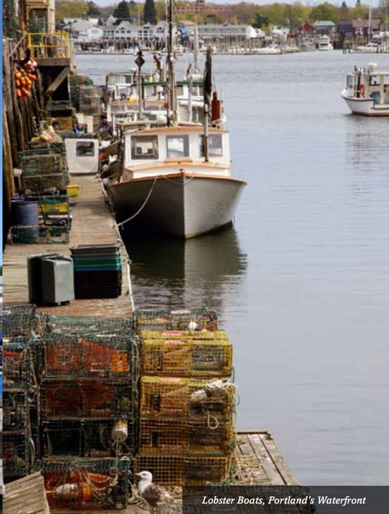
Lobster Boats, Portland's Waterfront