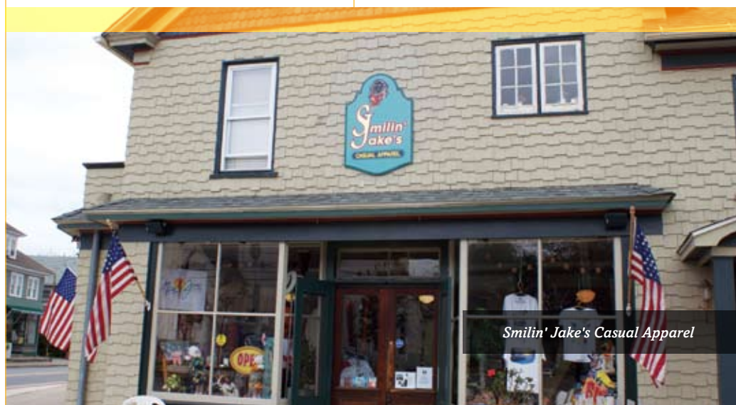
Smilin' Jake's Casual Apparel

Located in the heart of Rock Hall within easy reach of marinas, the Bay Wolf Restaurant features Austrian and Eastern Shore cuisine. Local pick-up from