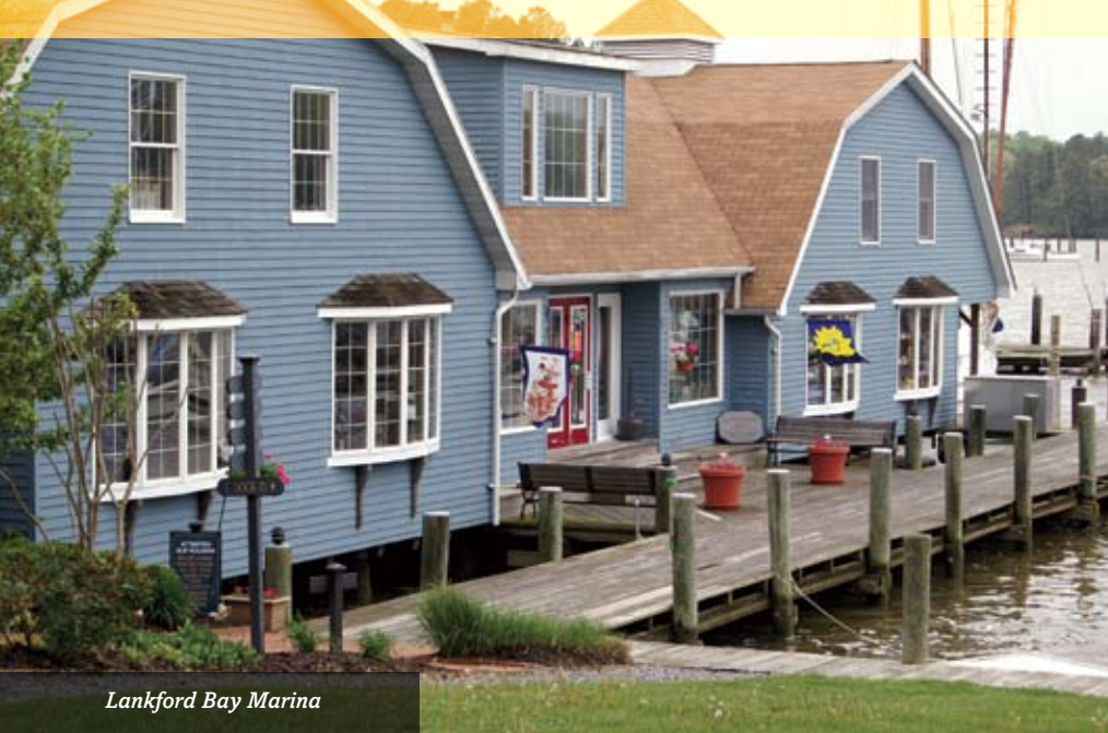
Lankford Bay Marina