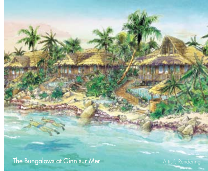
The Bungalows at Ginn sur Mer