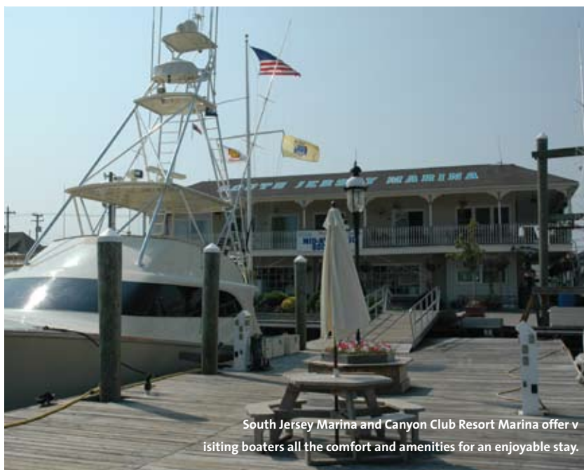
South Jersey Marina and Canyon Club Resort Marina offer visiting boaters all the comfort and amenities for an enjoyable stay.