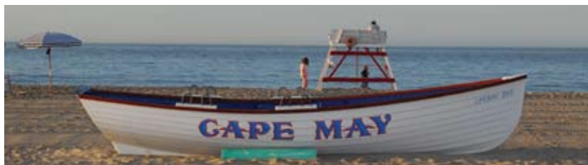
Cape May's beautiful beaches are among the cleanest and safest on the entire Atlantic Coast

Dining in Cape May is one of the best parts of any visit though picking from a list of restaurants is often a hard decision and you'll find everything from hot wings to cha-teaubriand available. Among the best are the Washington Inn, Ebbitt Room, 410 Bank St., Fresco's, Lobster House, Lucky Bones, C-View, Axelson's Blue Claw and Ugly Mug.