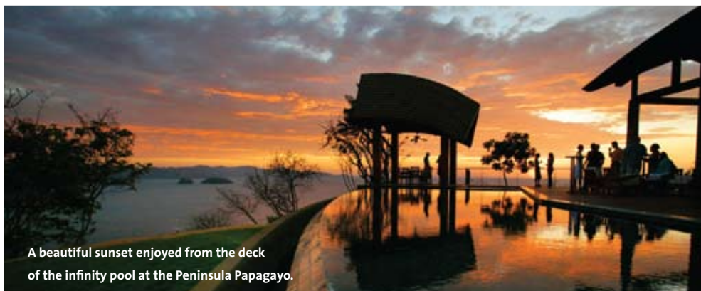
A beautiful sunset enjoyed from the deck of the infinity pool at the Peninsula Papagayo.

community and the first environmentally focused luxury resort and real estate project in Costa Rica. The development at Peninsula Papagayo includes the 153-room Four Seasons Resort, a private 18-hole Arnold Palmer Signature golf course, clubhouse and dining room, and a 38,000 square foot private beach club and spa.