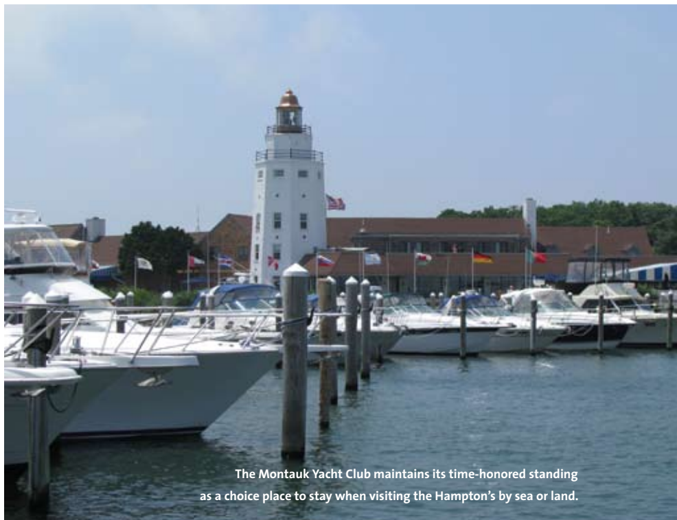
The Montauk Yacht Club maintains its time-honored standing as a choice place to stay when visiting the Hampton's by sea or land.

Visit www.montaukyachtclub.com for more information. ❖