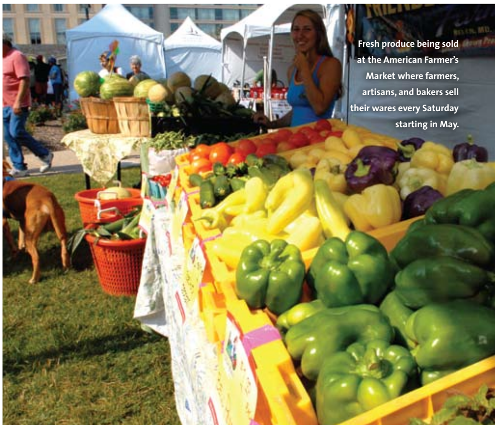
Fresh produce being sold at the American Farmer's Market where farmers, artisans, and bakers sell their wares every Saturday starting in May.