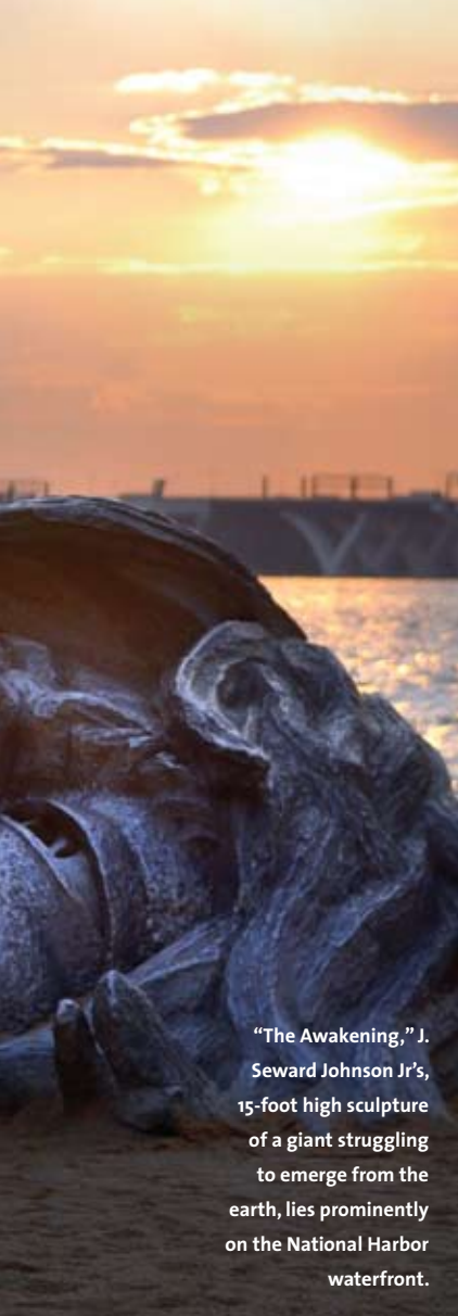
“The Awakening,” J. Seward Johnson Jr.’s, 15-foot high sculpture of a giant struggling to emerge from the earth, lies prominently on the National Harbor waterfront.