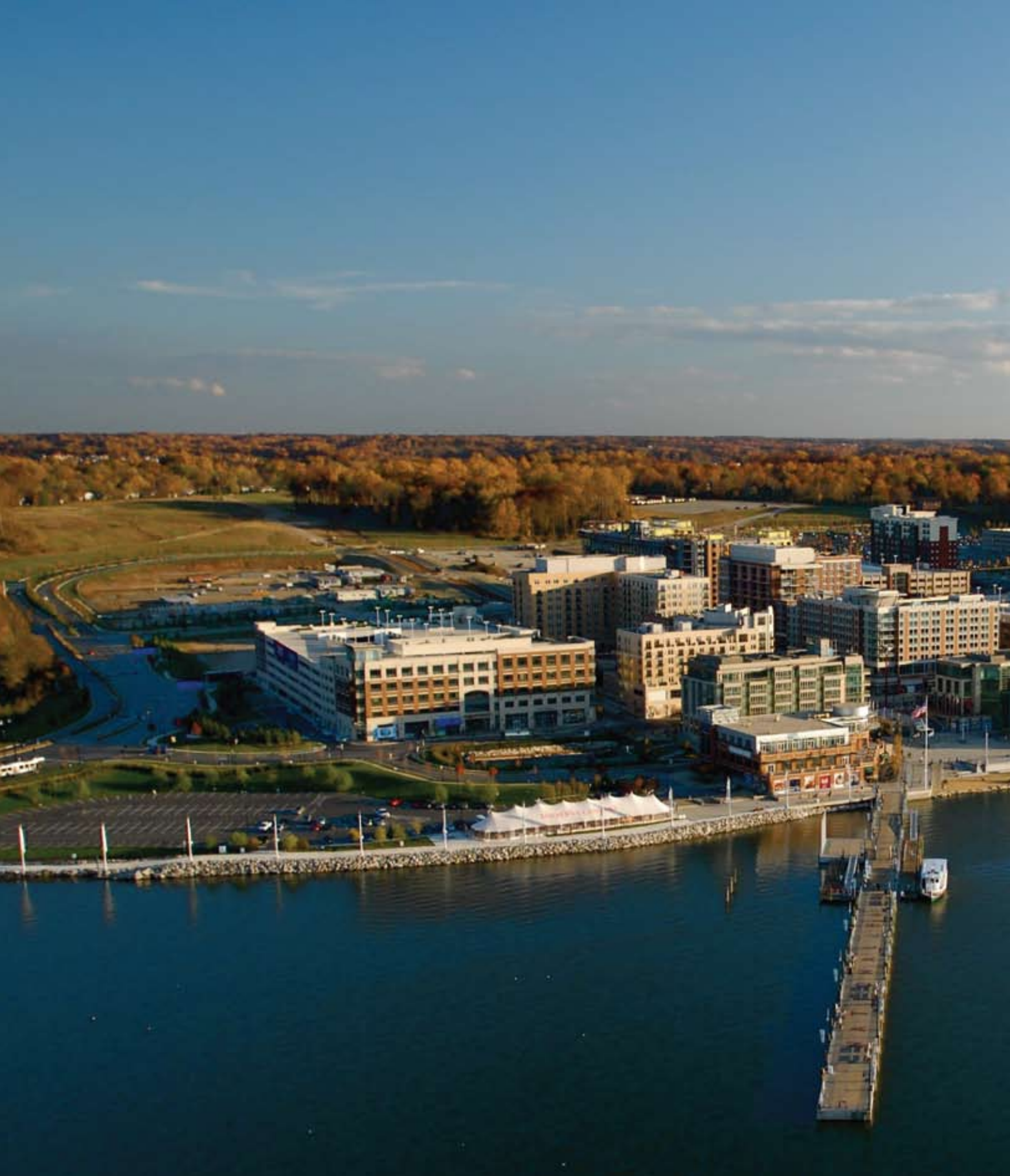
Aerial view of the National Harbor town center and marina on the banks of the Potomac River.