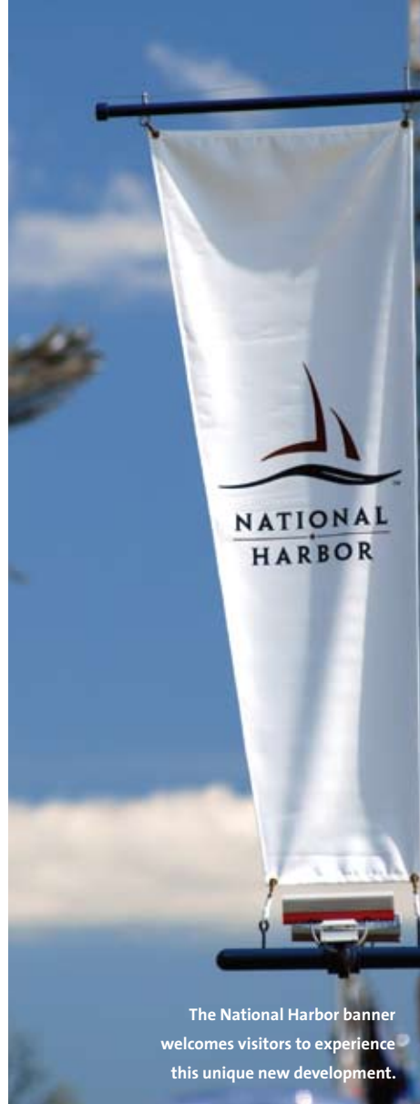
The National Harbor banner welcomes visitors to experience this unique new development.