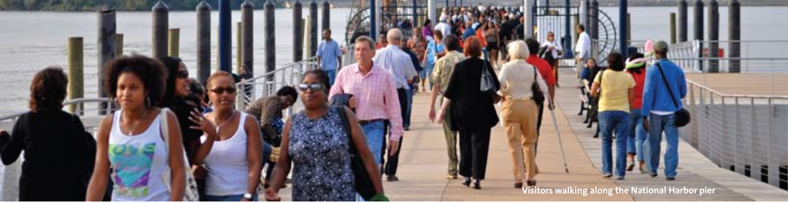
Visitors walking along the National Harbor pier

For a drink, head to Bobby McKey's, with its dueling piano players, or hit up Cadillac Ranch for a wild ride on the mechanical bull. Timothy Dean Bistro will open this year and feature an up-scale lounge atmosphere and live jazz.