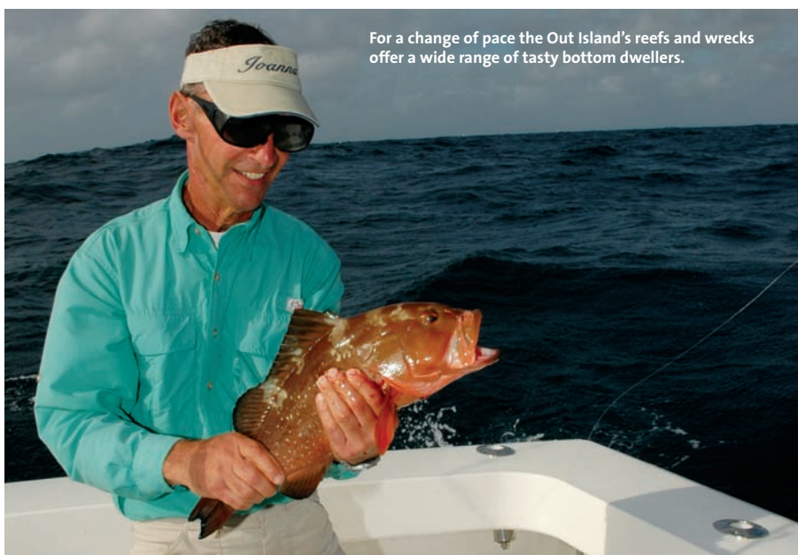
For a change of pace the Out Island's reefs and wrecks offer a wide range of tasty bottom dwellers.

Treasure Cay Hotel Resort & Marina on Treasure Cay is located less than 200 miles from Florida and here you'll find a 3½ mile beach with snow-white sand. Accommodation includes standard rooms, deluxe rooms and one, two or three bedroom suites. Rooms feature a garden side or marina view while suites have a private balcony overlooking the marina. The suites have a complete kitchen,