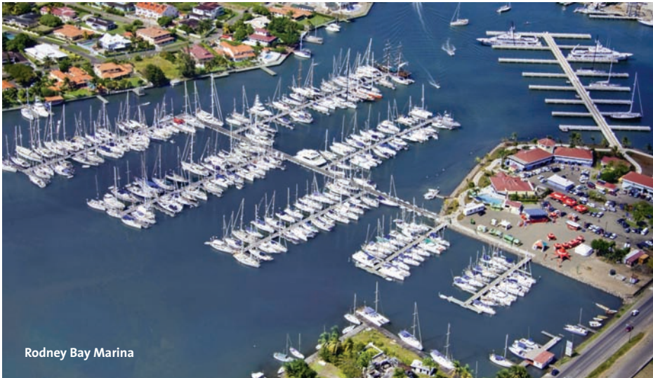
Rodney Bay Marina