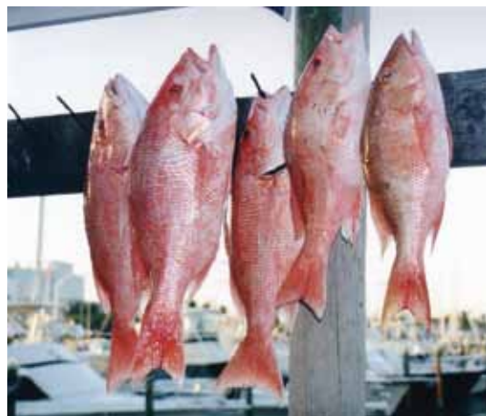
Red Snapper is an abundant fish in the waters near Fort Pierce City Marina. Visit the dock office for information about charters.