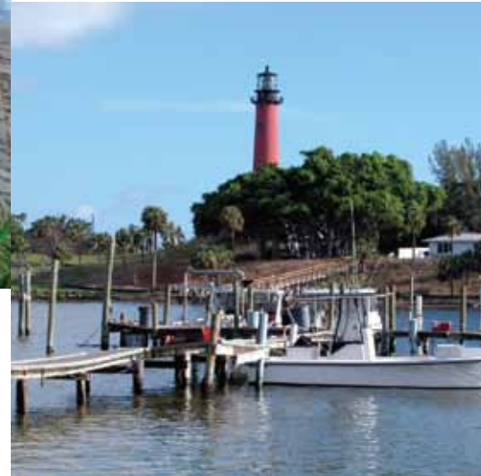
Completed in 1860 the Jupiter Lighthouse is the oldest structure in Palm Beach County.

Located just minutes from exquisite Palm Beach is the thriving town of Jupiter, tucked between million dollar waterfront homes and along crystal clear water. The atmosphere is as relaxing as it is exciting and the locals are very welcoming. Along the west side of the Intracoastal Waterway just after the Loxahatchee River merges with Jupiter Sounds is Admiral's Cove Marina (300 Admiral's Cove Blvd, 561-745-5961,