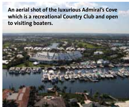
An aerial shot of the luxurious Admiral's Cove which is a recreational Country Club and open to visiting boaters.

Need a drink? Stop into Marina Café (200 Admiral's Cove Blvd., 561-744-1700) nestled beside Admiral's Cove Olympic-sized swimming pool, they serve great light fare and refreshing frozen drinks! For a traditional meal in a cozy setting go to Fairways (200 Admiral's Cove Blvd., 561-744-1700) also located at Admiral's Cove. The intimate fireplace and inviting porch suit the equally classic menu. m/