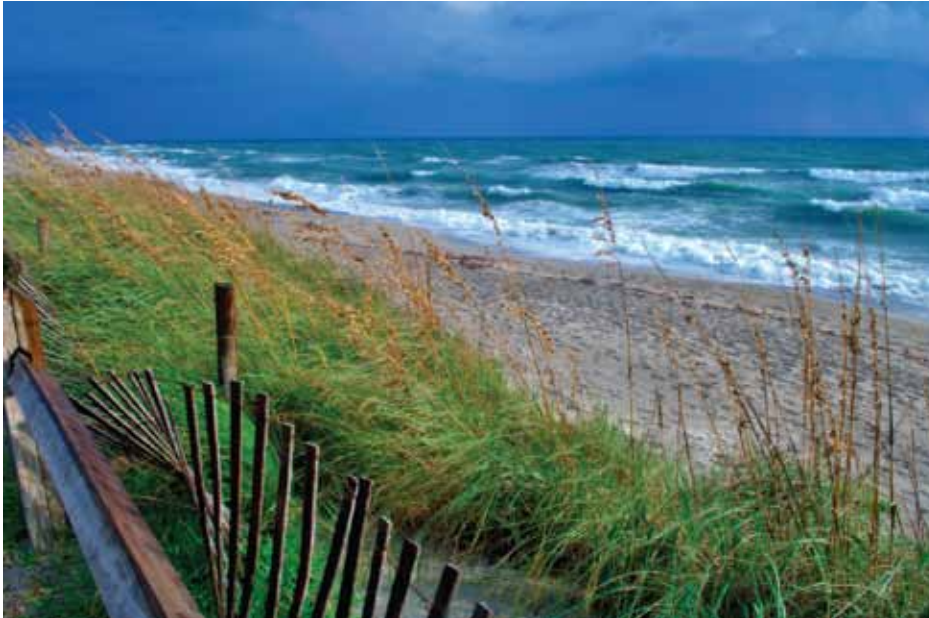
Jupiter is known for its beautiful and dog friendly beaches. Dogs are allowed on unguarded Jupiter beaches as long as they are on a leash.