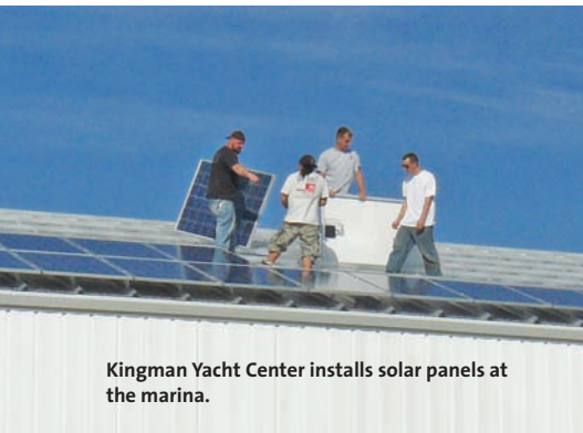
Kingman Yacht Center installs solar panels at the marina.